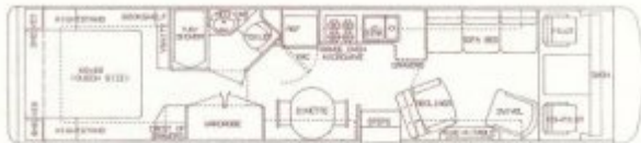
3600 U225/U240 SBI