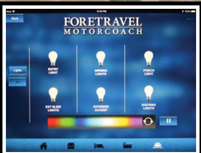
iPad integration for TV's, shades, lights and house functions.