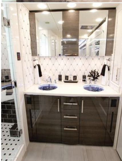
The ih-45 50th Anniversary Model is graced with high-gloss cabinetry throughout, including the bedroom (above), where the bed has a power headrest. Dual lavatories in the rear bath are brightened by LED rim accent lighting (left).