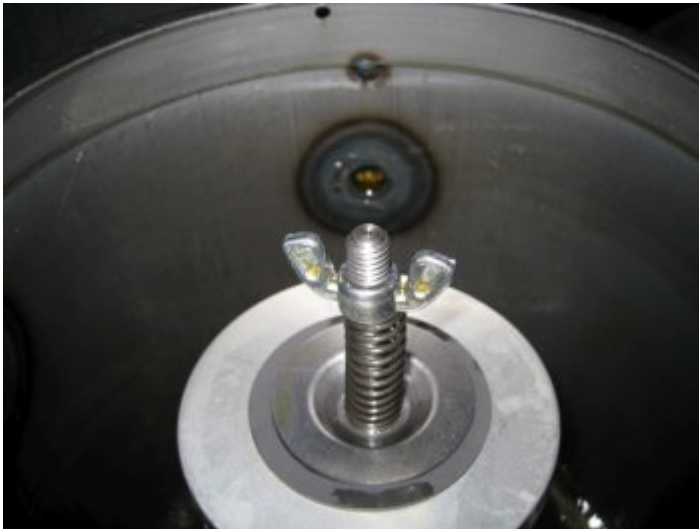
Complete filter installation. Three filters on filter guide post with centering cap in place. Spring and wing nut keep filters in place, sealed to each other forcing all fluid to go through filters.