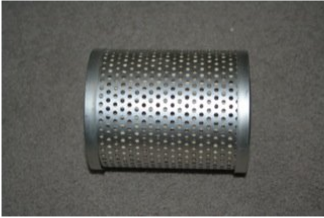
Nelson 84101B Filter