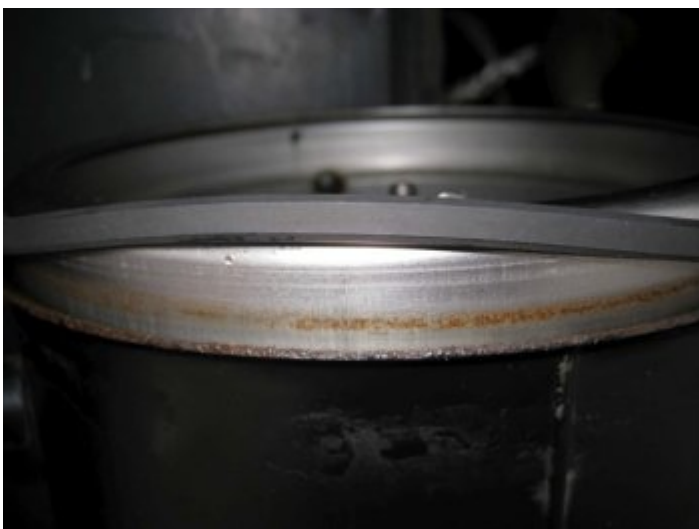
New gasket in place but not seated all the way down. When cover is placed on tank it seals against gasket forcing it