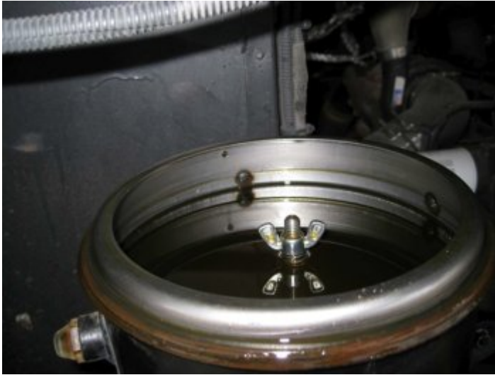
Uncovered tank full of oil with old filters held down in place with spring & wing nut