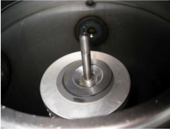
Concave cap partly in place. Note filter cap center that contacts the bottom of the spring.