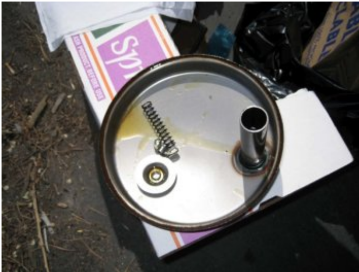
Upside down (Cover Assembly - Cummins # Q-80132) shows dip stick tube. Edges of cover should be sanded to remove any rust as the inner edge seals to the rubber gasket. Laying in the cover are three loose pieces: