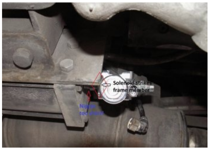
The solenoid on the new assembly is a little wider than on the old one Part #29522717. As a result, reusing the old nipple did not work. I had to get something longer. Found a 3/8" x 2" nipple at the local auto parts store, which worked fine.

https://wiki.foreforums.com/ Printed on 2025/03/13 13:54