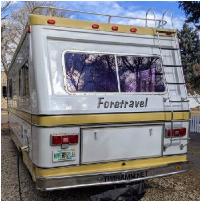
1975 M23-CB Foretravel (Rear)