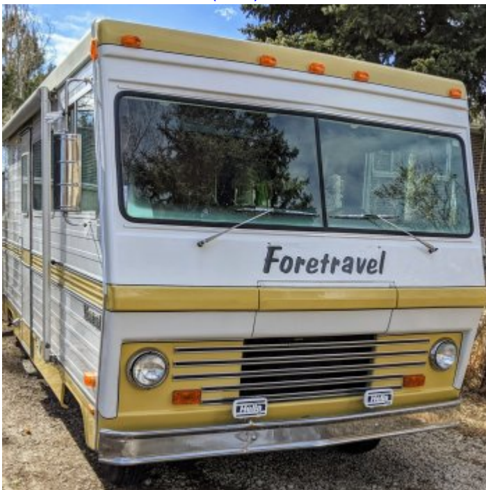
1975 M23-CB Foretravel