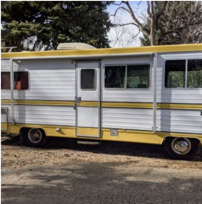
1975 M23-CB Foretravel (Side)