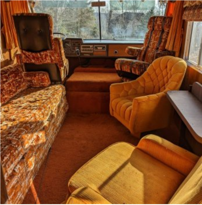
1979 Foretravel Interior