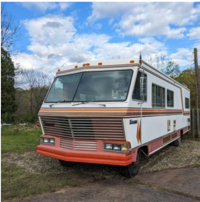
1979 Foretravel FTX