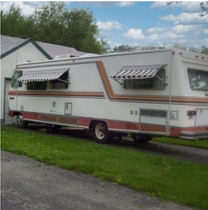
1979 33' Foretravel