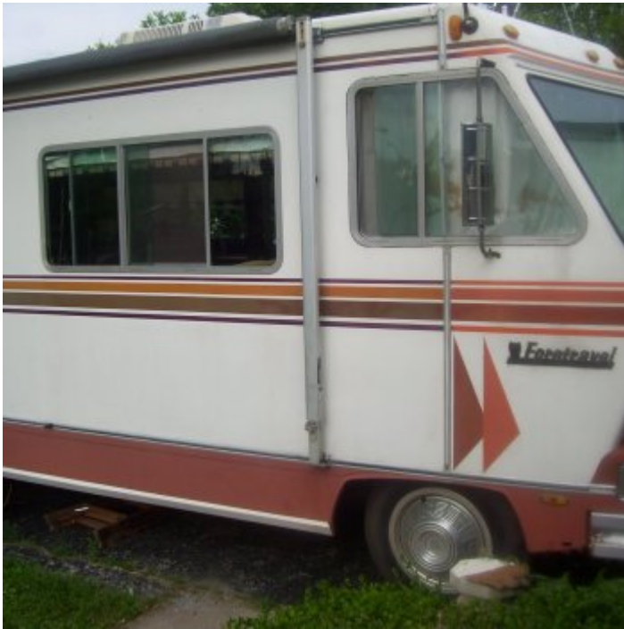
1979 33' Foretravel