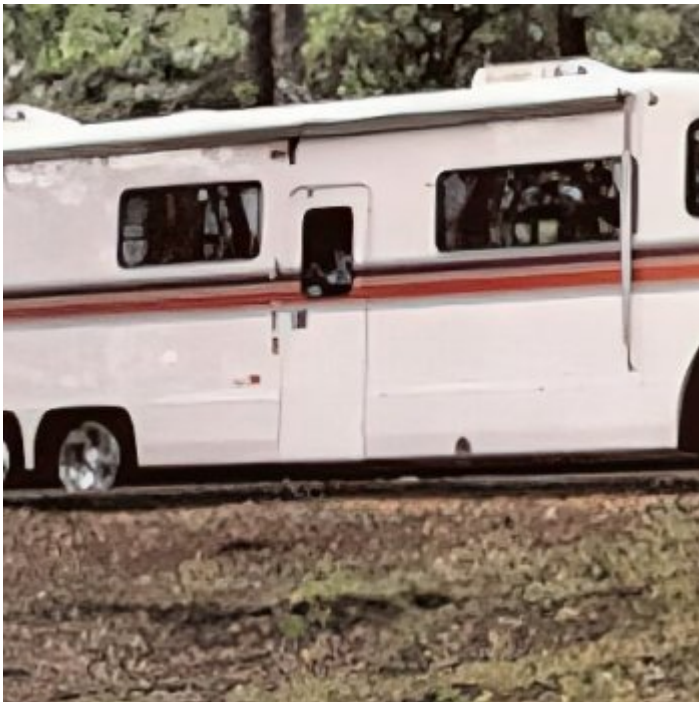
1986 Foretravel Grand Villa Poster