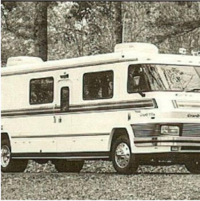
1986 Foretravel Grand Villa Poster