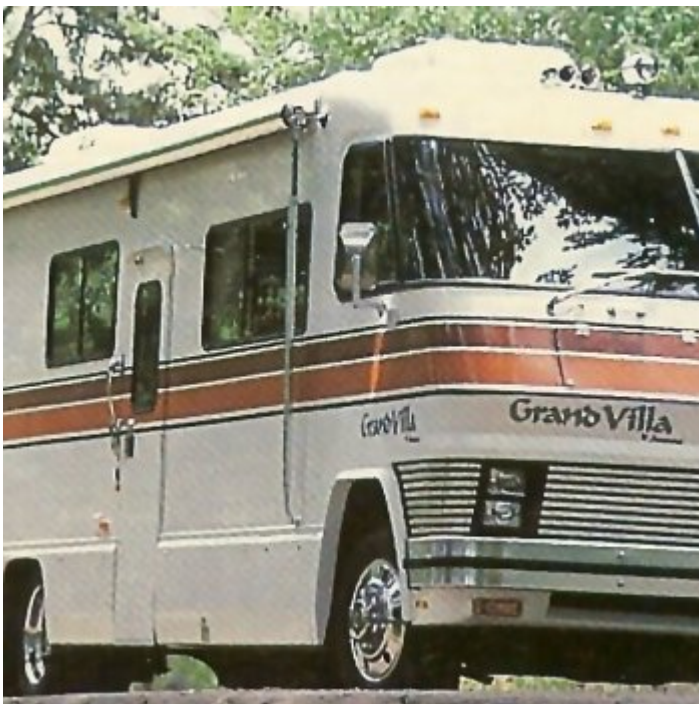
1986 Foretravel Grand Villa Poster