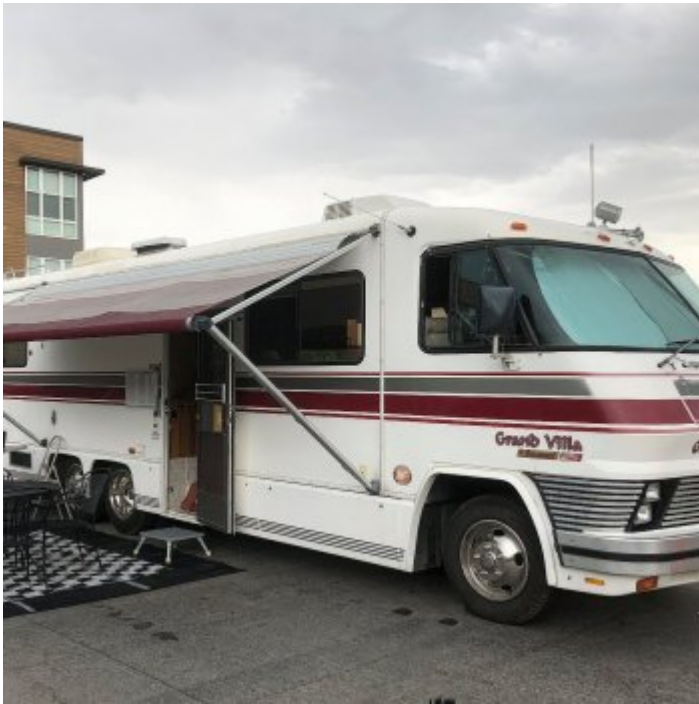
1986 Foretravel Grand Villa