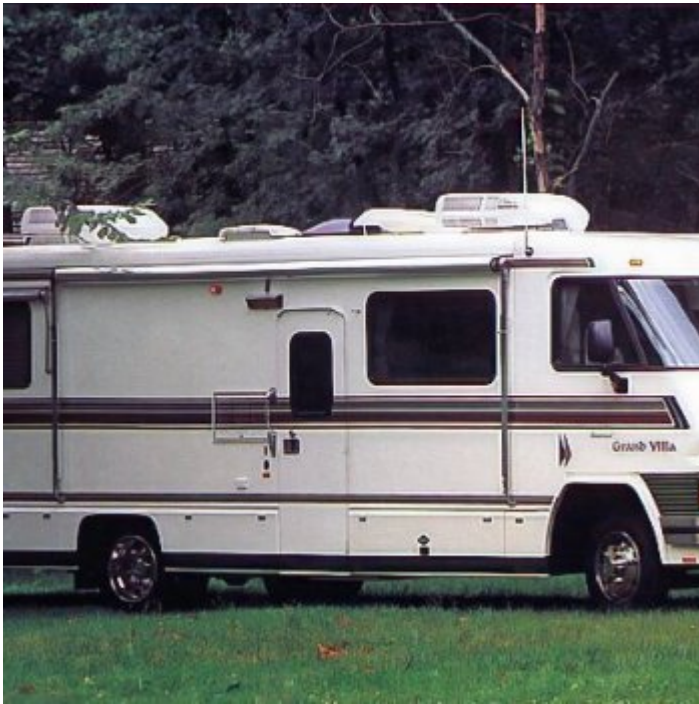
1993 Grand Villa Poster