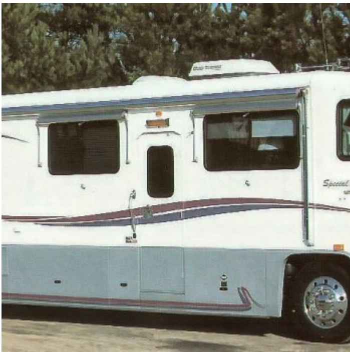
1993 U300 SE Poster