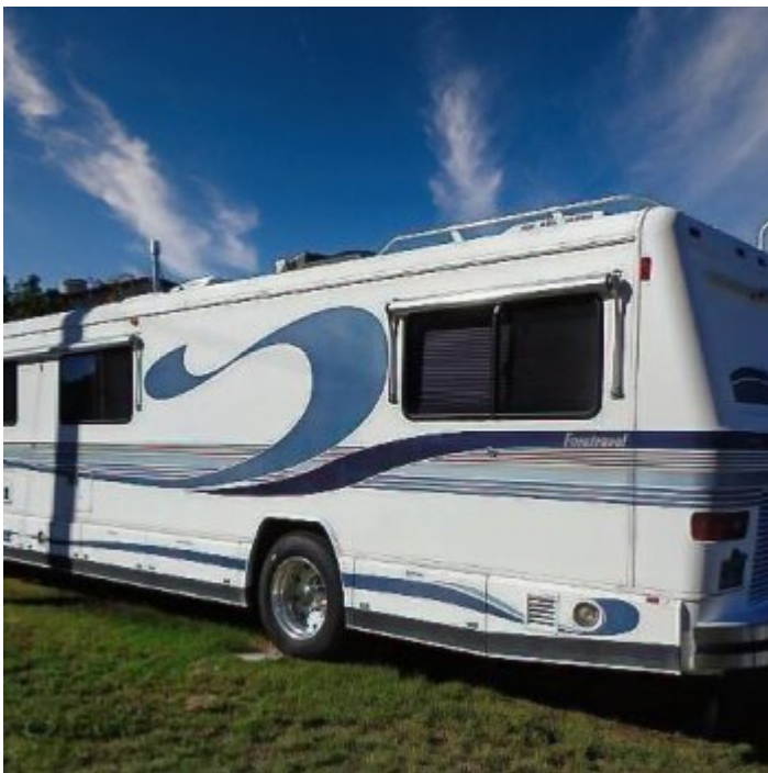
1994 U300 Rear Side Ph