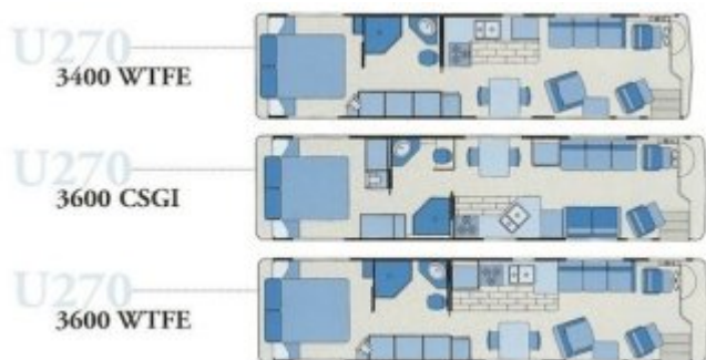
1998 U270 Floor Plans