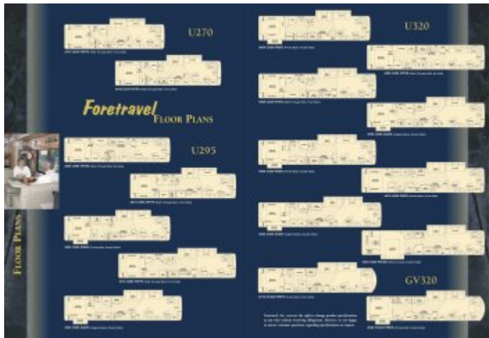
2003 Floor Plans