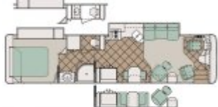
U295 36' PBLC