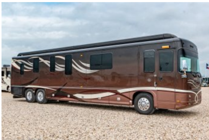
2009 Nimbus "CE"