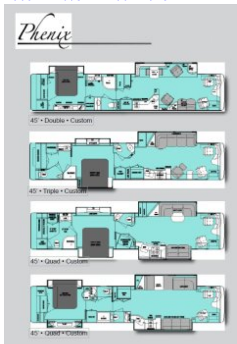
2009 Phenix Floor Plans