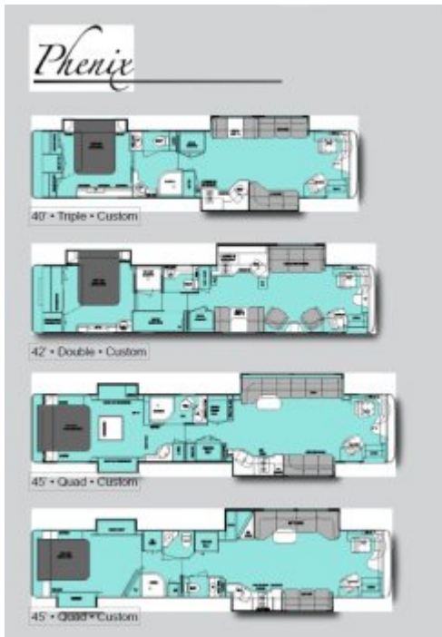
2009 Phenix Floor Plans