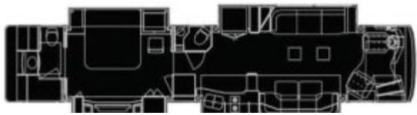
2018 Realm Floor Plans