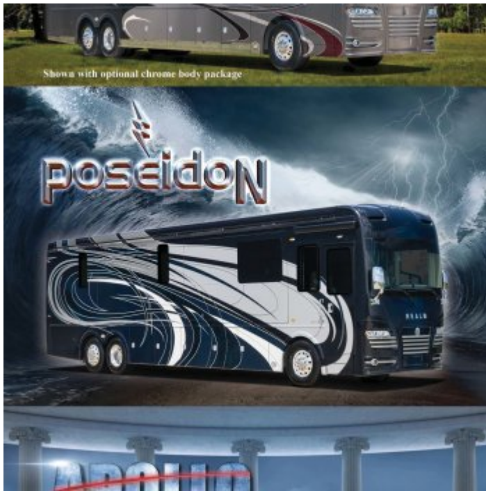
2018 Realm Exteriors