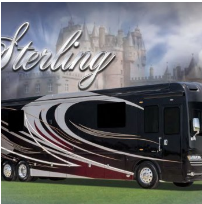
2019 Realm Exteriors