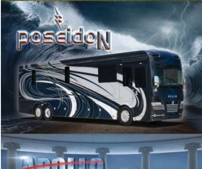
2019 Realm Exteriors