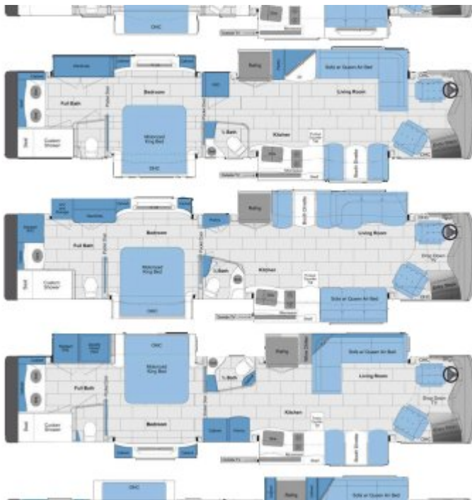
2019 IH-45 Floor Plans