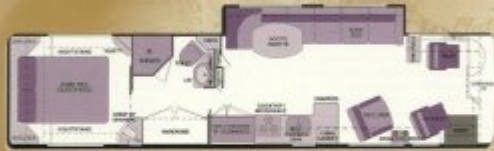
3610 U295 WTPE