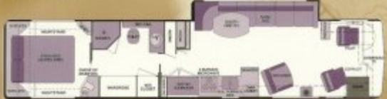
4010 U295 WTPE