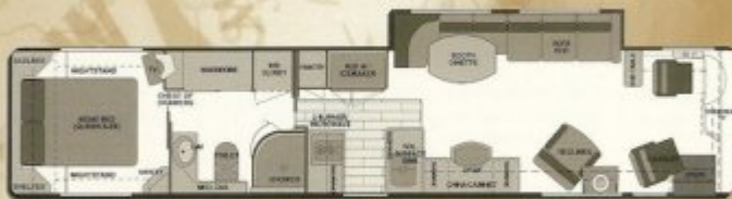
4210 U320 DGFE