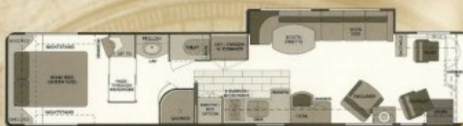
4210 U320 CAI