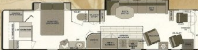
4220 U320 WCPE