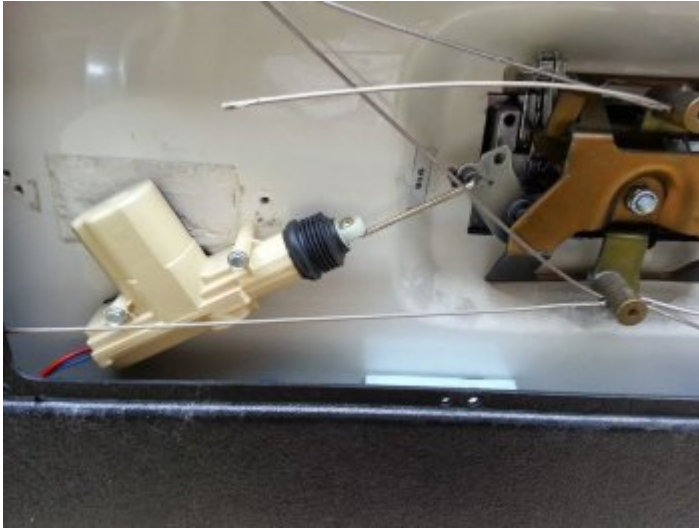
Mes installation example

No matter which direction you go, you will need to account for the swing/arc of the new actuators (which are linear) as compared to the OEM which moved on an arc. There are different ways to accomplish this and still work with the original TriMark door latches.