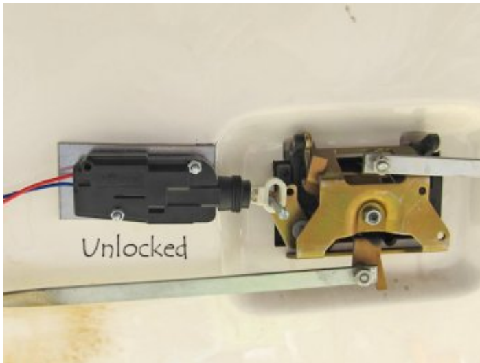
Bulldog installation example

$25 can be to much, especially if you have to replace 8 to 10 of them, but if you look around you can find "universal" ones on EBay or Amazon for ~$8 to $10. No idea of the quality.