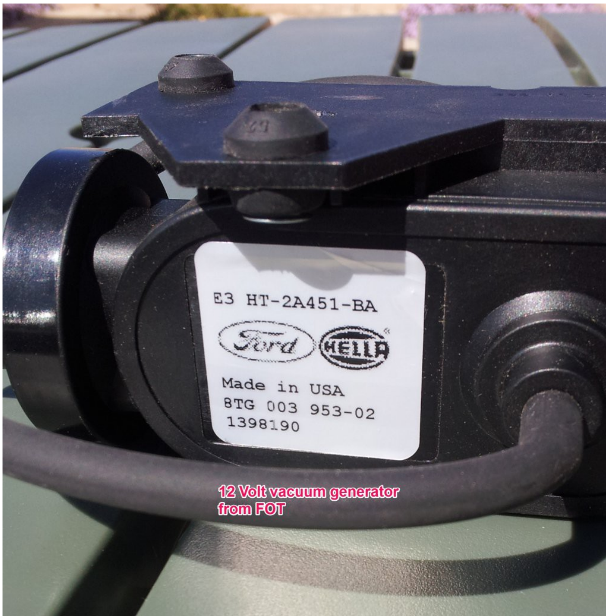
Part number. E3 HT-2A451-BA by Dick 2003 U320 40'