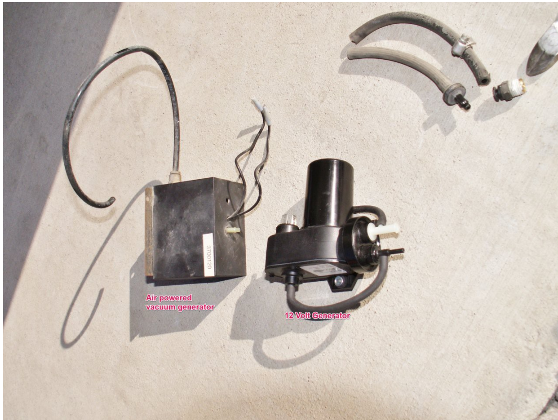
Old and New Vacuum Generator

Finally got this project finished. FOT no longer has a source for the vacuum reservoir; at least not now. The factory quit making them in about 2006. A neighbor suggested filling mine with water to see where it leaked. Found the leak and he gave me a marine epoxy sealant to fix it. Now the doors in the dash HVAC work again and no air leaks!