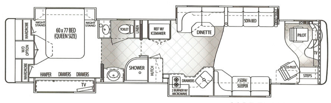
MODEL NO. 42Q3