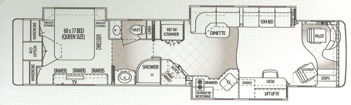
MODEL NO. 42T1