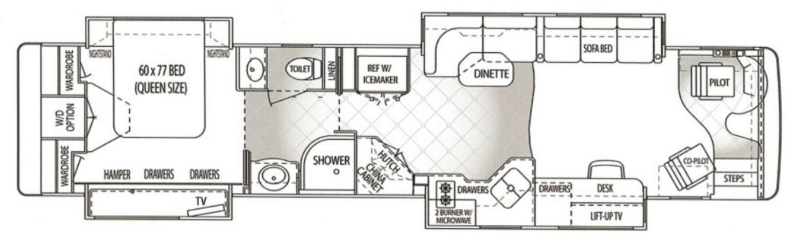
MODEL NO. 42Q1