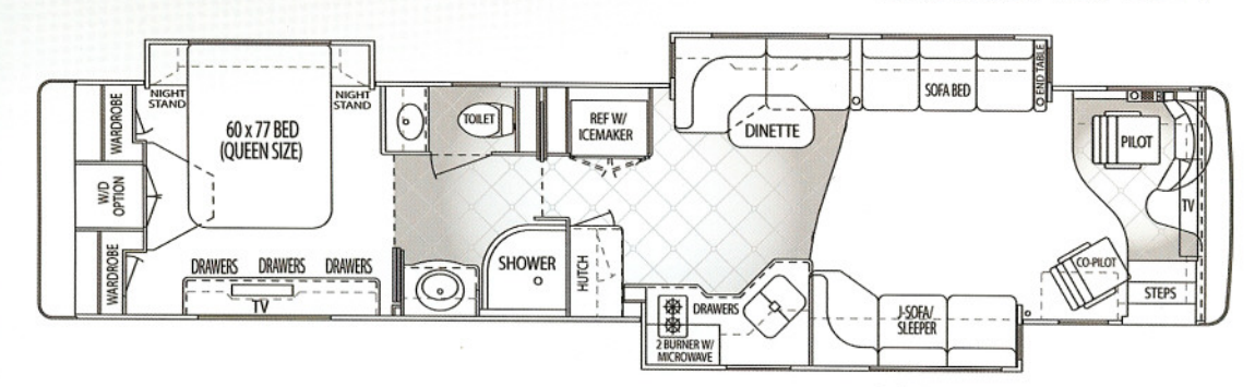
MODEL NO. 42T3