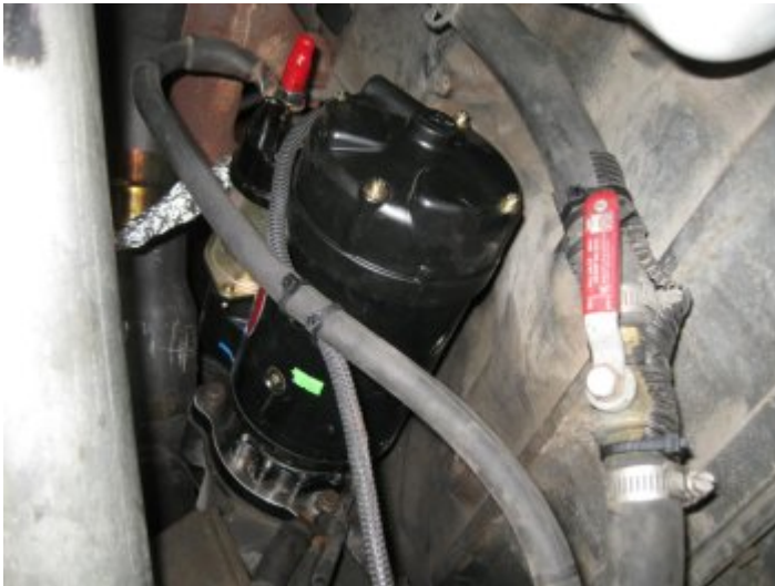
New starter installed