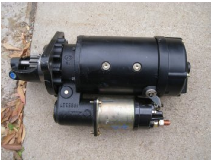
Delco Remy 10478818 41MT, 12-tooth NEW starter