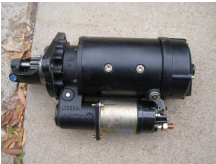
Delco Remy 10478818 41MT, 12-tooth NEW starter