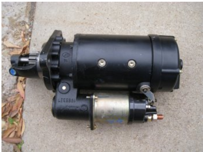
Delco Remy 10478818 41MT, 12-tooth NEW starter