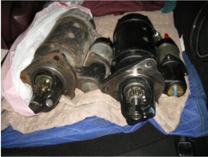
Delco Remy 10478818 41MT, 12-tooth old & new Starters