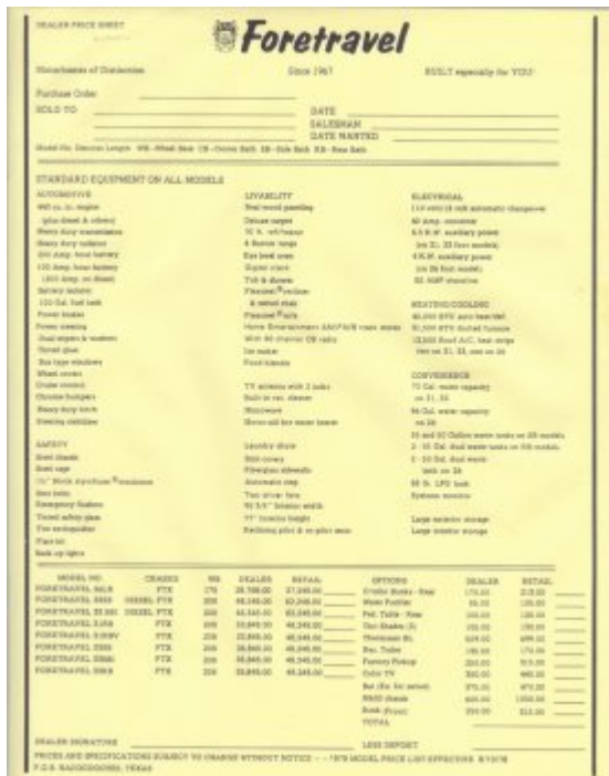
1979 FTX Specifications and Dealer Price Sheet