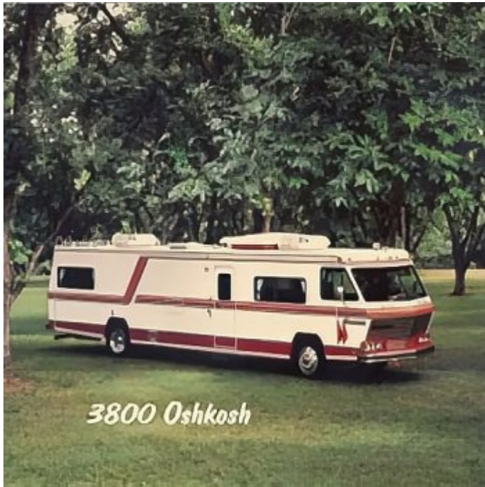
1985 38' Oshkosh Poster