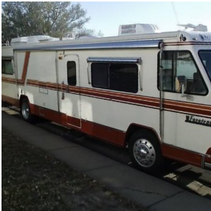
1985 35' ORED