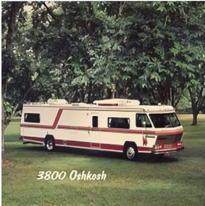
1985 38' Oshkosh Poster