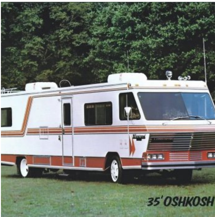
1985 35SB Oshosh Poster