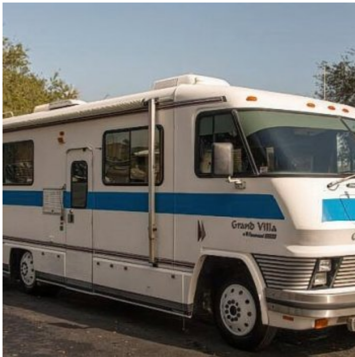
1986 Foretravel 34' Grand Villa