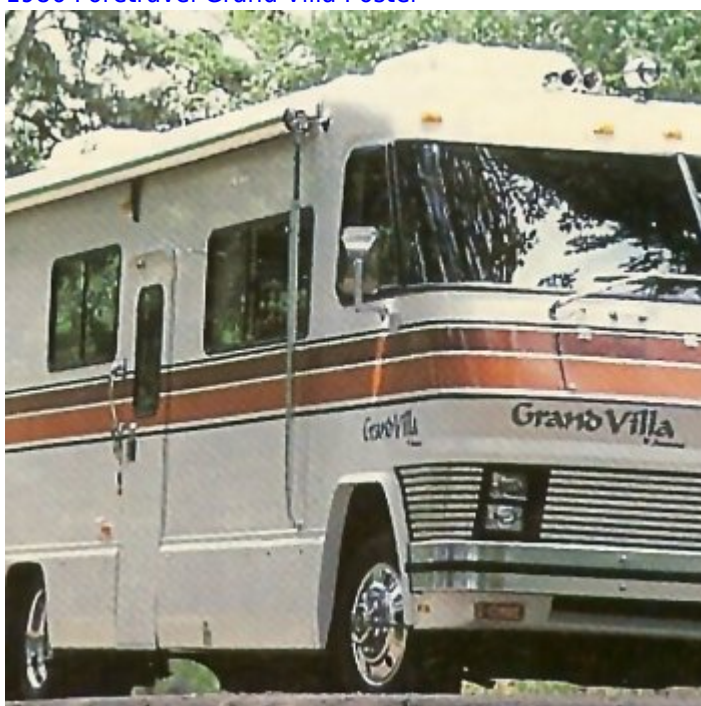
1986 Foretravel Grand Villa Poster