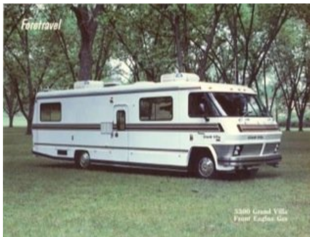
1988 3300 Front Gas Poster