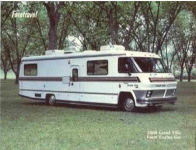
1988 3300 Front Gas Poster