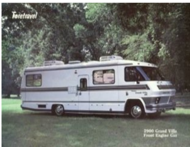
1988 29' Front Gas Poster