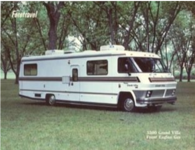
1988 3300 Front Gas Poster