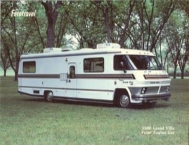
1988 3300 Front Gas Poster