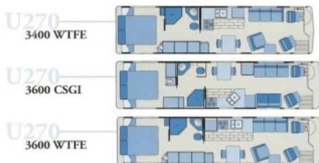
1998 U270 Floor Plans