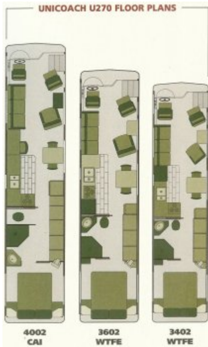
1999 U270 Floor Plans