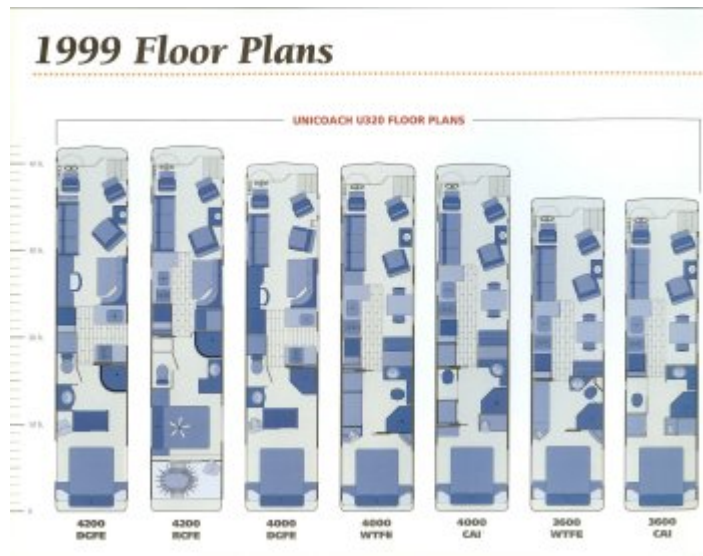
1999 U320 Floor Plans