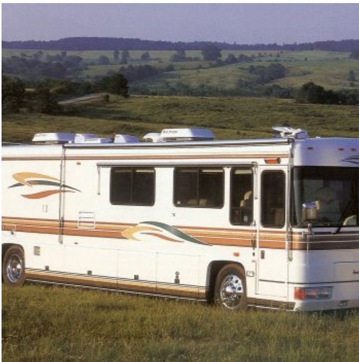
2000 U270 Poster