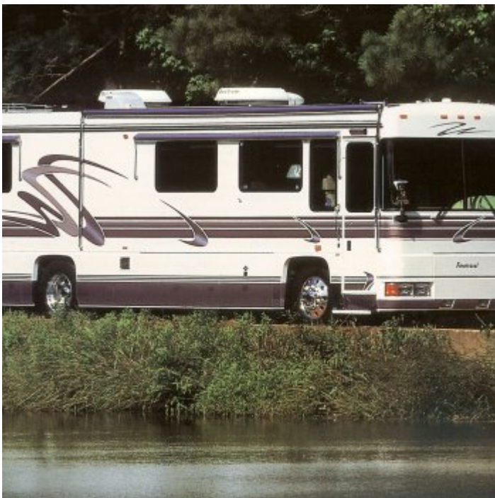
2000 U295 Poster