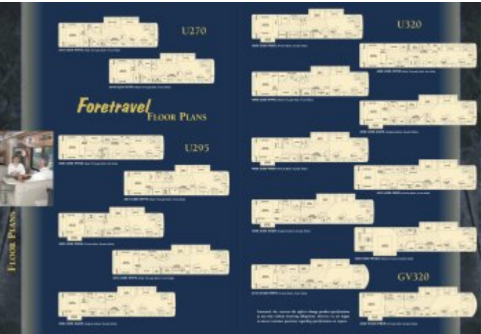
2003 Floor Plans