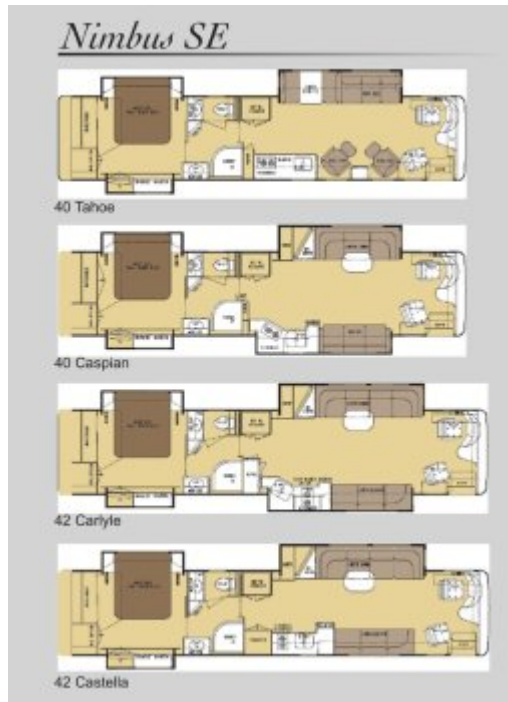
2008 Nimbus SE Floor Plans