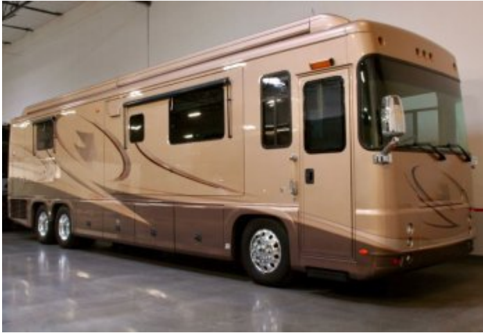
2008 Nimbus SE