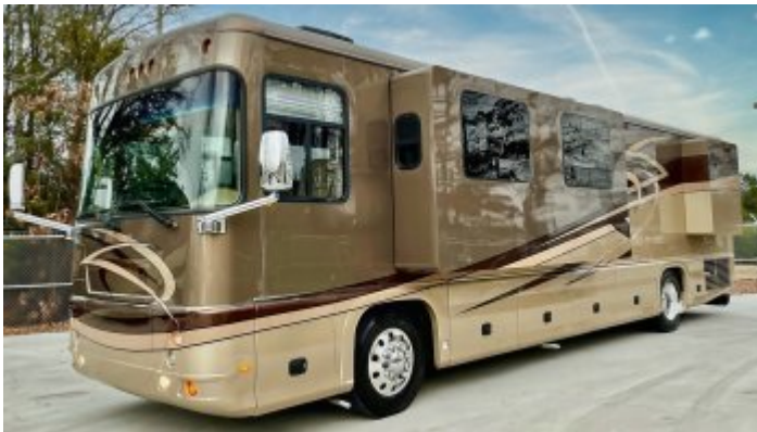
2008 Nimbus XT