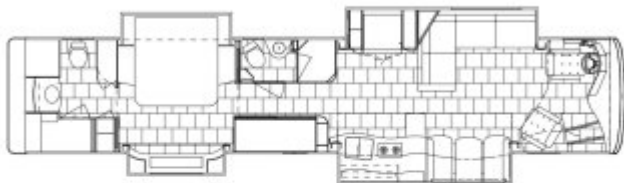
FP 5 (Bunk)