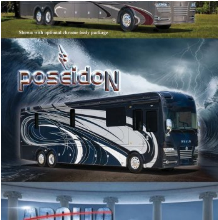
2018 Realm Exteriors