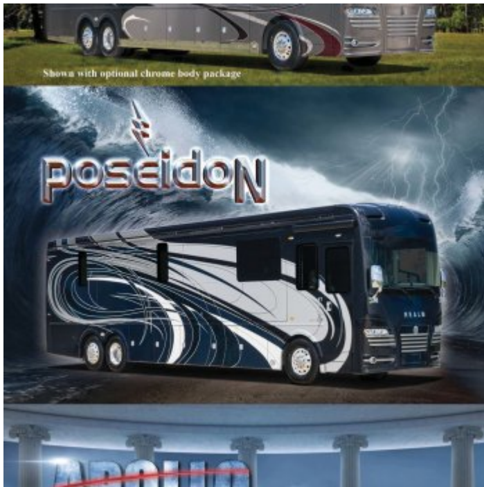
2018 Realm Exteriors