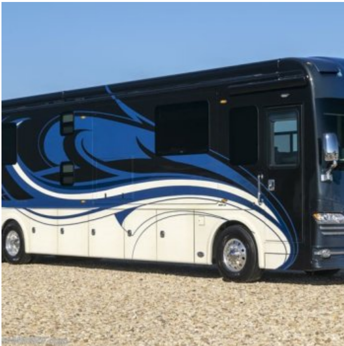
Realm FS6 2020