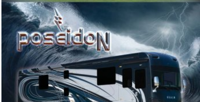
2020 Realm Exteriors