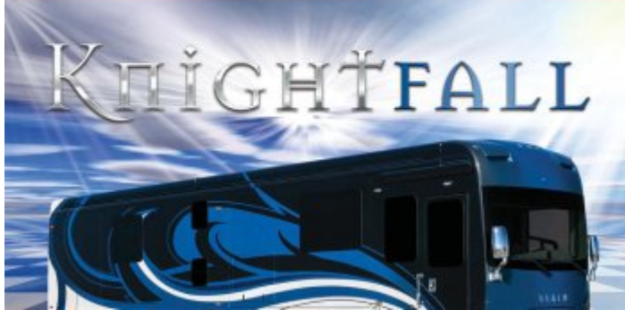
2020 Realm Exteriors